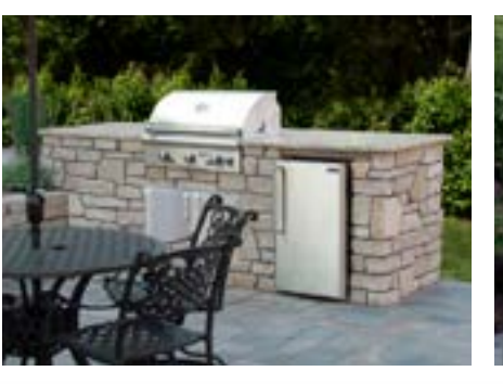
9' Straight Outdoor Kitchen Kit

The patented system can create infinitely configurable kitchen island layouts that assemble in minutes. The idea is to keep the process simple so you can enjoy your outdoor kitchen as soon as possible!